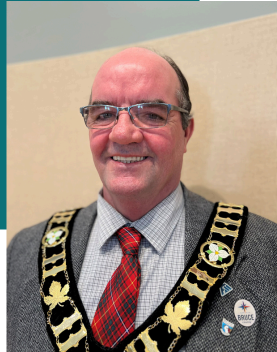
Don Murray Mayor